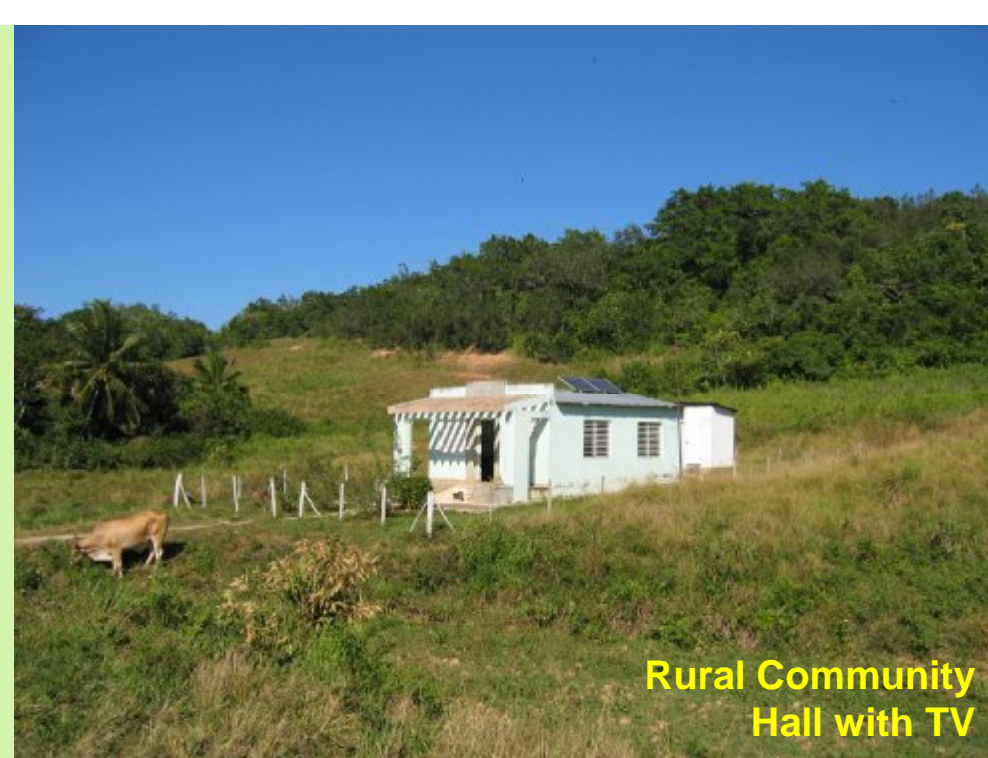
Rural Community Hall with TV