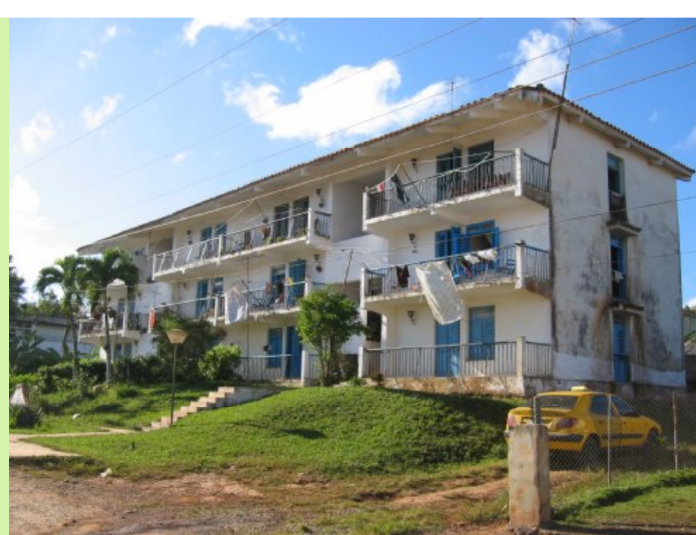
PUBLIC HOUSING – 2 TO 5 STOREY WALKUP APPARTMENTS